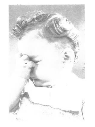
I can't remember how many trumps are out.

I don't know how to use TikTok, but I can write in cursive, do long division and tell time on clocks with hands... so there's that.